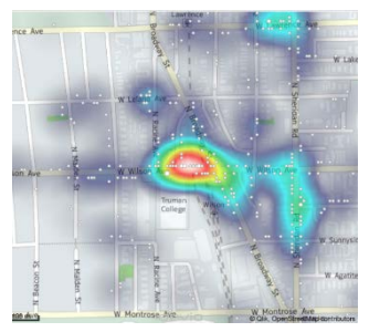
Bubble symbols and heat maps

The on-the-fly location lookup capabilities of Qlik GeoAnalytics enables users to easily add rich, interactive geo visualizations to their Qlik apps. With an integral location library that contains millions of pre-defined places and areas, any map within a QlikView or Qlik Sense app is automatically populated and updated. Multiple map and visualization layers enable users to explore, in one tailored visualization, all geo information along with any relationships.