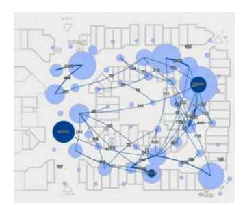
Path analysis of customer traffic within shopping center

With a full spectrum of mapping and geospatial capabilities that share a common set of tools and technologies, Qlik GeoAnalytics can meet the needs of a wide variety of location-related use cases. Qlik GeoAnalytics offers customers the flexibility to implement a fully hosted solution, a completely on premise implementation or a combination of the two. And having already been implemented in multiple industries and across different business functions, one can be confident that Qlik GeoAnalytics can meet the specific requirements of a customer's geospatial project.