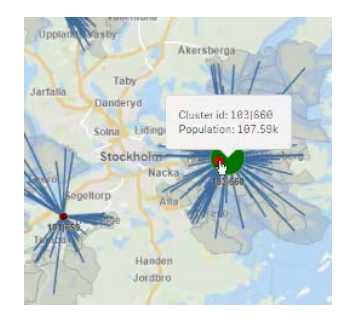
Cluster function to determine which hub is the closest to each municipality

Qlik GeoAnalytics allows organizations to go beyond map visualizations to understand and analyze geospatial relationships. Gain insight into patterns not easily interpreted through tables or charts. The power of Qlik's associative model can be applied to analyze geo data relationships with non-geo data as well as uncover non-relationships. Easy incorporate external geospatial data or map layers into your visualization or analysis; even import spatial information such as CAD files for indoor mapping applications.